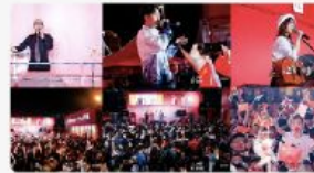
Music events hosted by NetEase Cloud Music

NetEase's efforts to help independent musicians to be heard and appreciated also give us a competitive edge. In this way, fostering the growth of independent music both opens a bigger market for the musicians and also introduces original and diversified content to our users, which contributes to our sustainable growth.